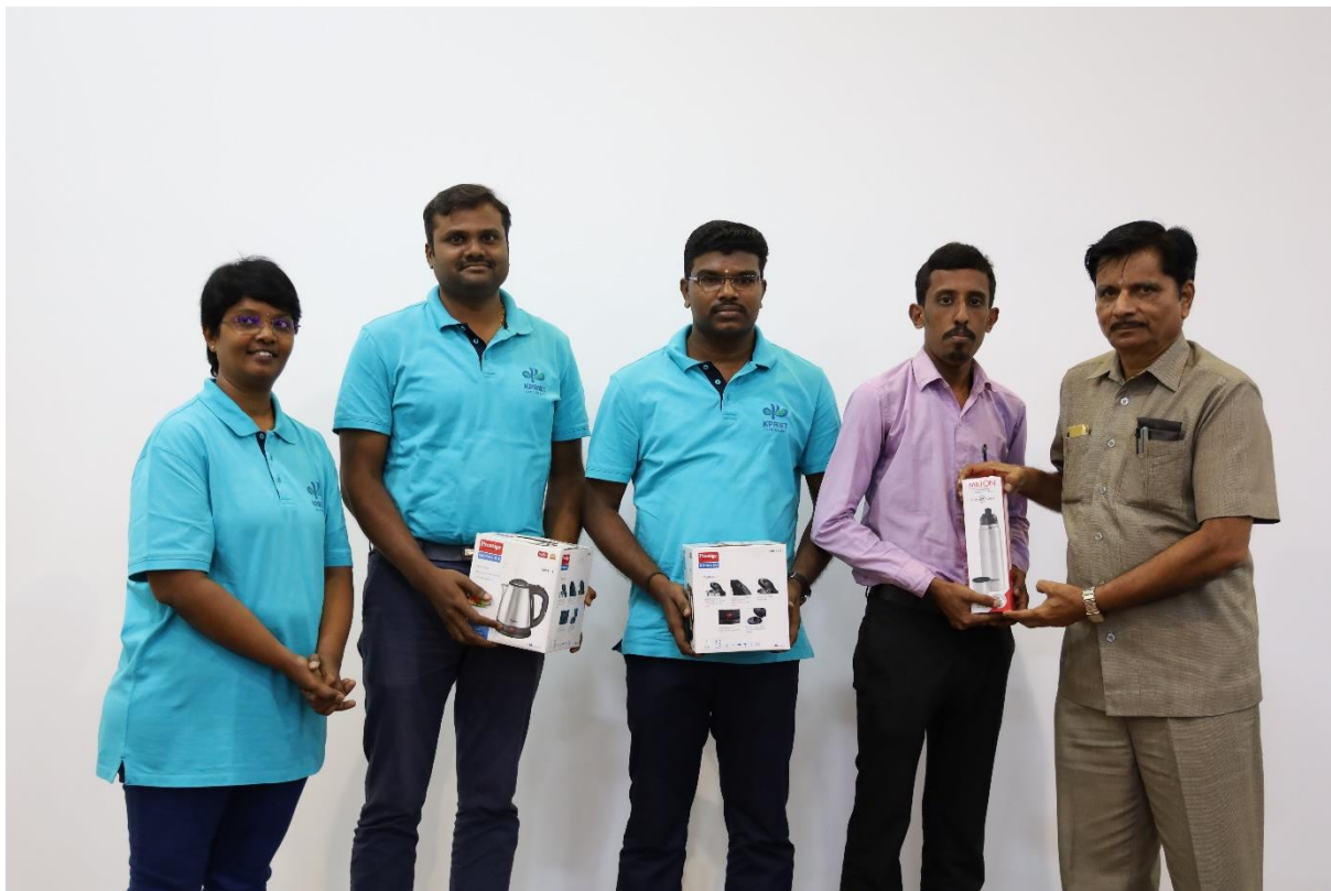
CASH PRIZE TO RASC FOR THEIR ACHIEVEMENT